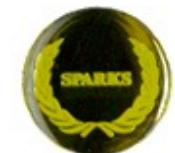
WO Year 3