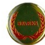
WO Year 2